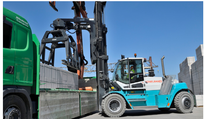
One of the two SMV 12-1200 C operating at Heidelberg site, handling their special stone packages made by sand-lime bricks.