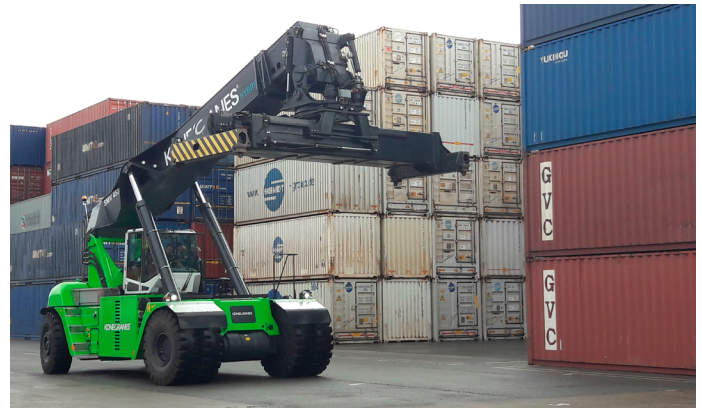
Hybrid Reach Stacker model SMV 4531 HLT in operation at Duisburg International Terminal - DIT, Germany

At Krupp Port, the hybrid reach stacker is used in load handling, all container handling and operating in the container stock in a three-shift system. The hybrid reach stacker and its regenerative power feature has cut down fuel consumption in everyday container handling and increased the productivity and cost-